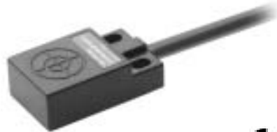
Miniature Flat Pack